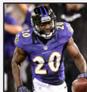
Reed - 24th Pick 9 Pro Bowls '04 Def. POY