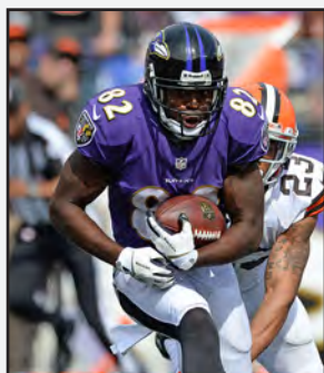
Torrey Smith (2nd round, 2011)