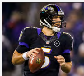
Flacco - 18th Pick Super Bowl XLVII MVP