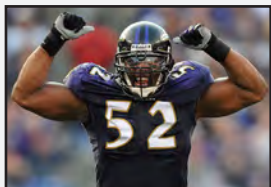
Lewis - 26th Pick 13 Pro Bowls '00 & '03 Def. POY