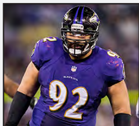
Ngata - 12th Pick 5 Pro Bowls

The Ravens have consistently found gems in the middle and later portions of the first round, including standouts LB Ray Lewis (26th), S Ed Reed (24th), DT Haloti Ngata (12th), QB Joe Flacco (18th) and CB Jimmy Smith (27th). Additionally, Pro Bowlers like TE Todd Heap (2001) and G Ben Grubbs (2007) were tabbed late in the first round.