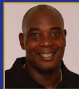
OZZIE NEWSOME General Manager & Exec. Vice President